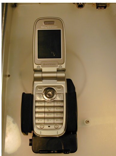
Rohde & Schwarz Shield Box and Coupler